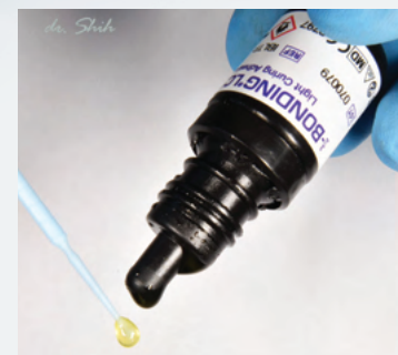
The procedure was performed by © Dr. Shih.