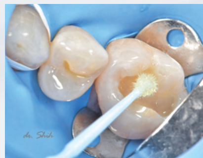
The procedure was performed by © Dr. Shih.